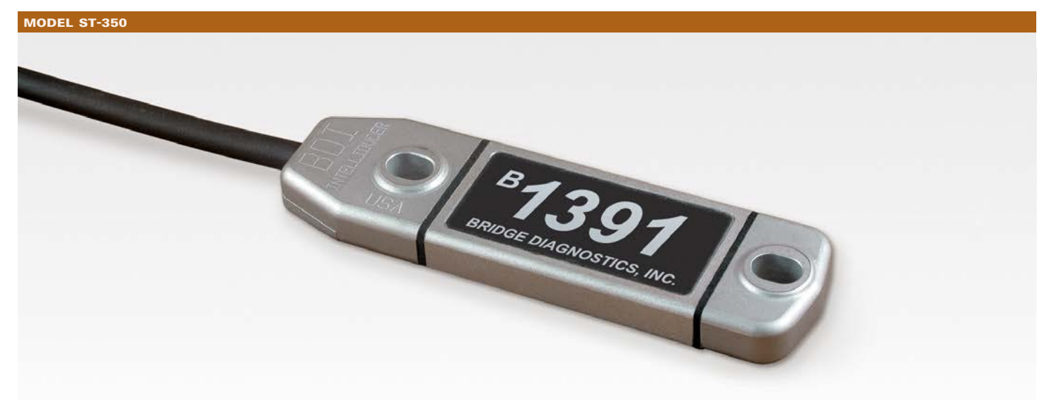
Model ST-350 Dynamic Strain Transducer.